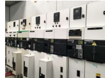
Medium Voltage Switchgears