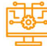
SCADA for power plant supervision