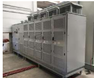
Low Voltage Switchgear