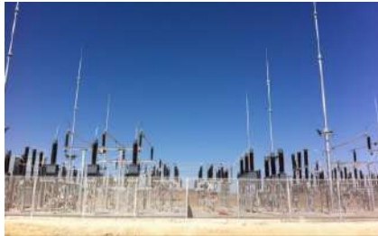
High Voltage Substation

Preliminary, definitive and construction design, project management of: